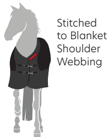
Stitched to Blanket Shoulder Webbing